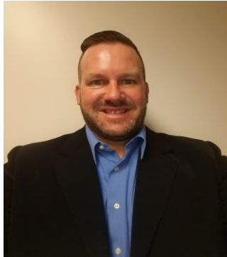
Sr. Credit Risk Mgr.