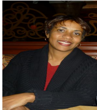
Sr. Dir. Global Process Owner