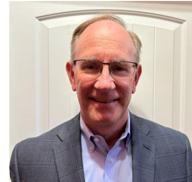
Dir. Shared Services