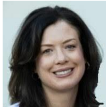
F&A Director NA Credit Operations